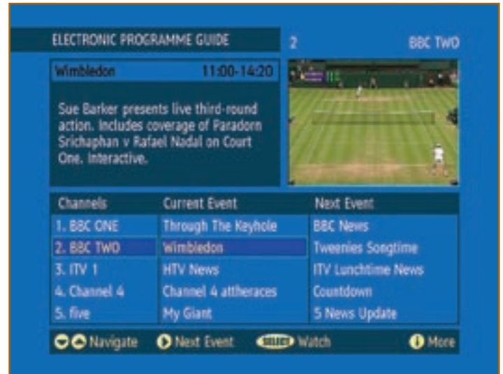
Example middleware application